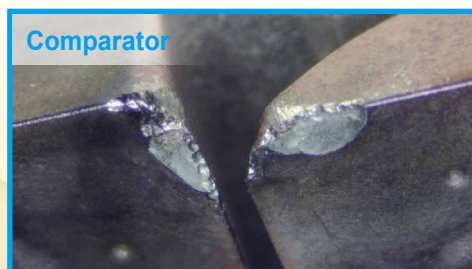
Insert edge Comparison